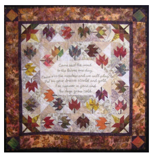
Come Said the Wind

My latest quilt I designed involved printing a poem onto fabric.